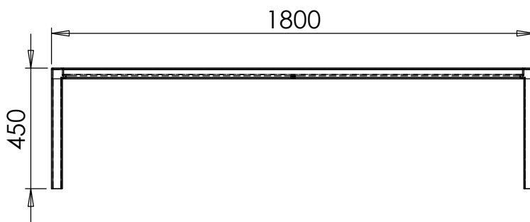
Front Elevation of Bench